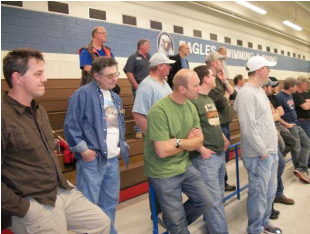
Pool Demonstration at Apollo by Thorne Brothers

12261 CO RD 4, AVON, MN 56310 (320) 363-8110 LOCATED IN ST WENDEL