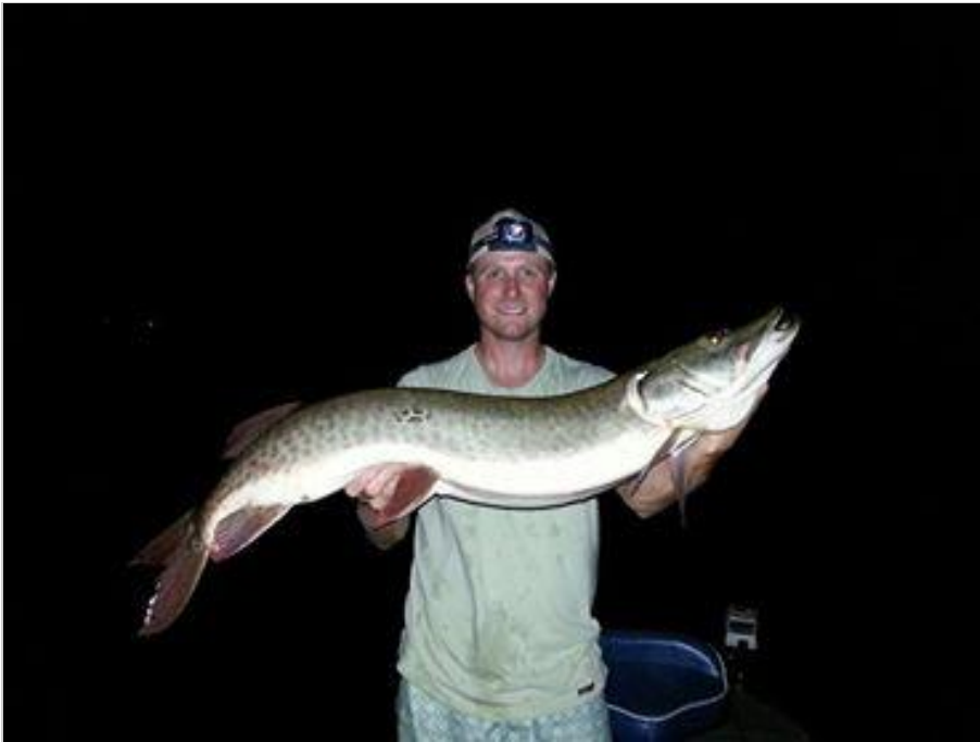
First night fish!! On the 8!! 43"