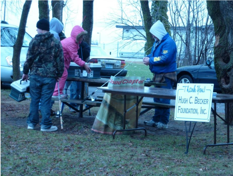
Getting the Rods set up for the kids