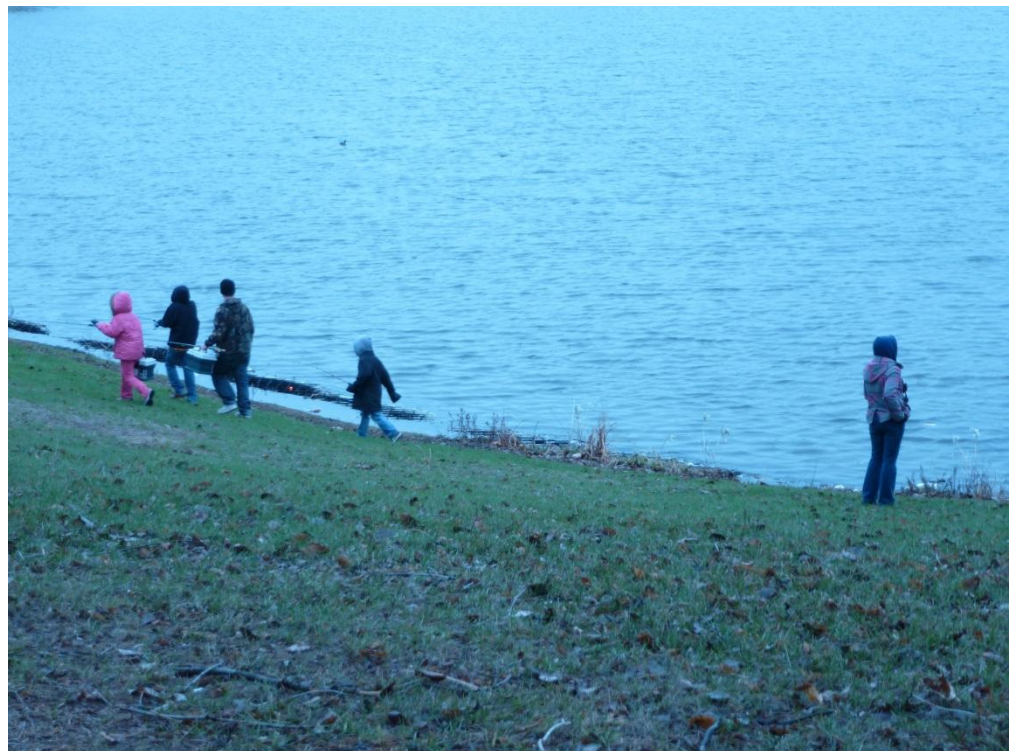
The "Little's" finding the best spots!!