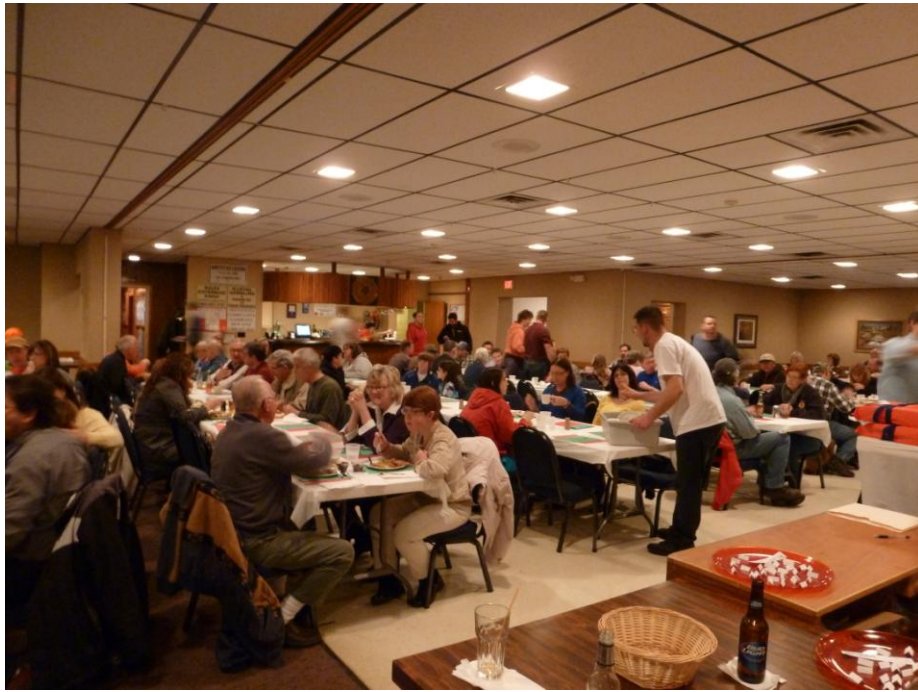
FISH DINNER CROWD