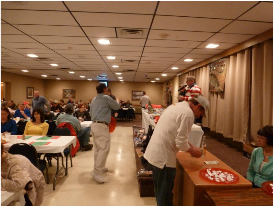
Working the tip boards and prizes