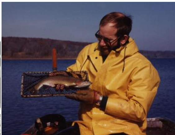
Rainbow trout at Big Watab Lake, 1989