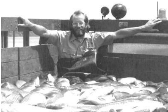
With truckload of carp, Hutchinson, 1979.