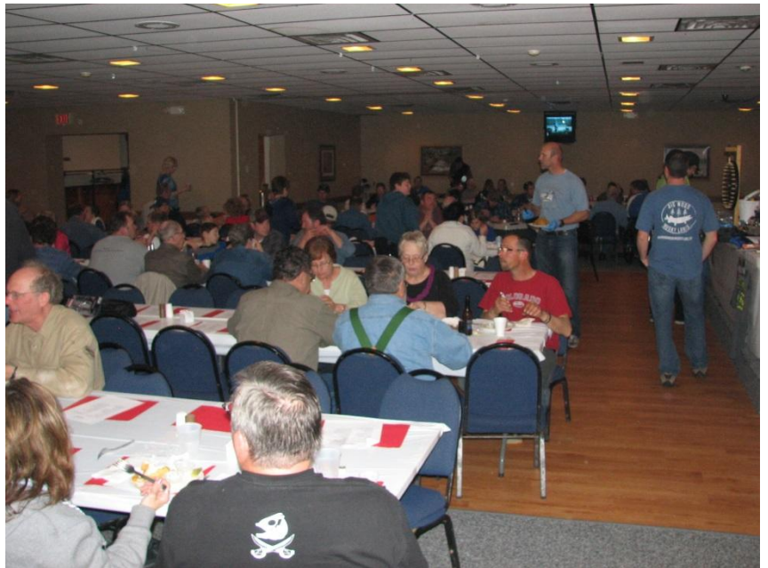
A Full House of Hungry People