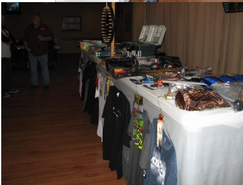
Tip Board Table Prizes