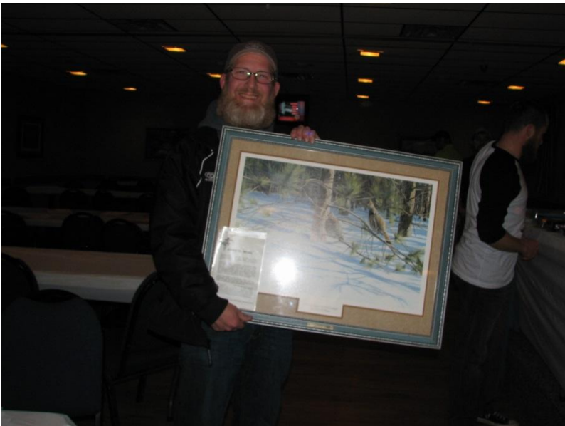
Winner of the Raffle Prize